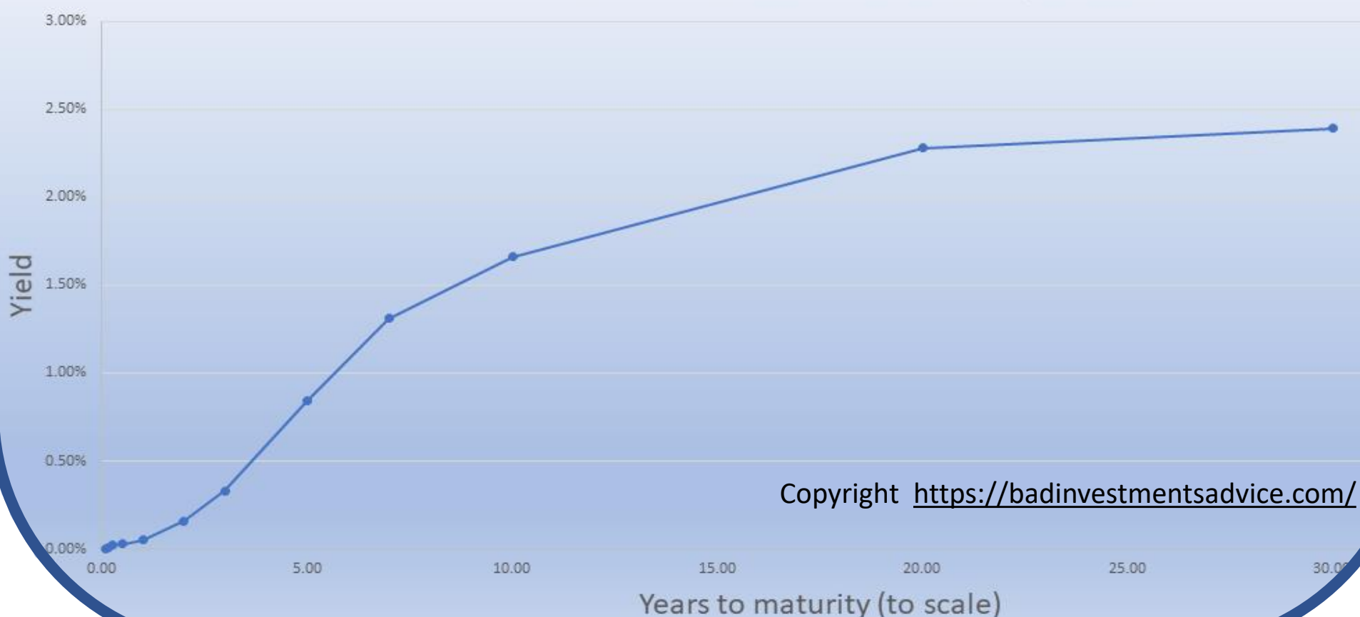
US Government Treasuries 13 May 2021